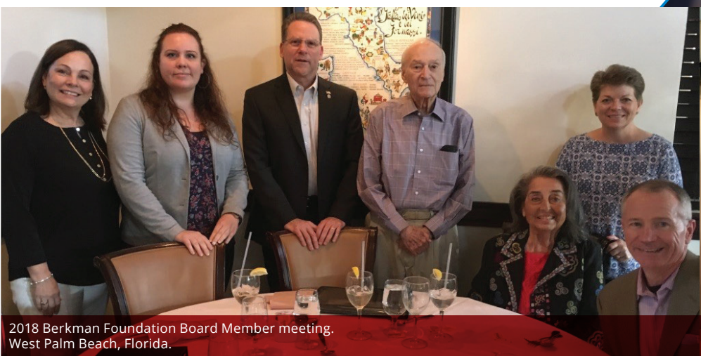
2018 Berkman Foundation Board Member meeting. West Palm Beach, Florida.