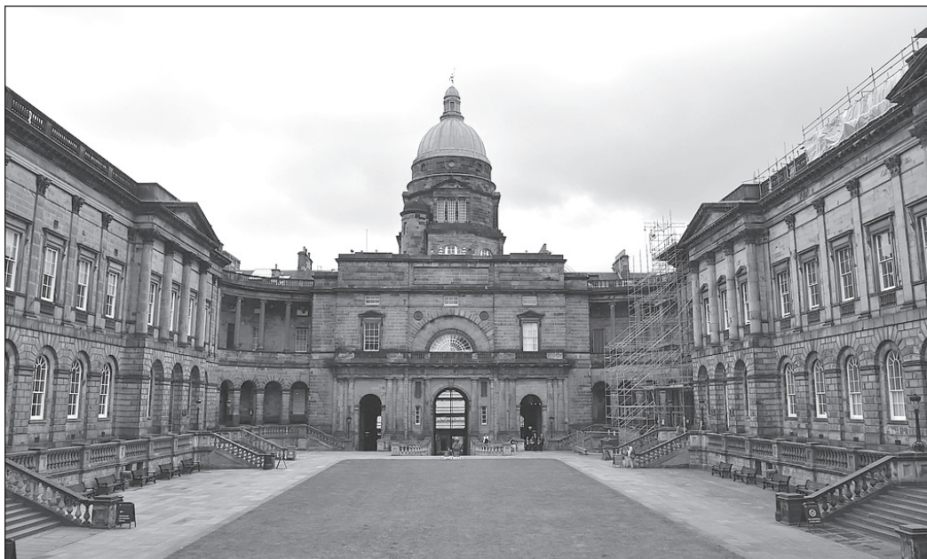
Old College, University of Edinburgh