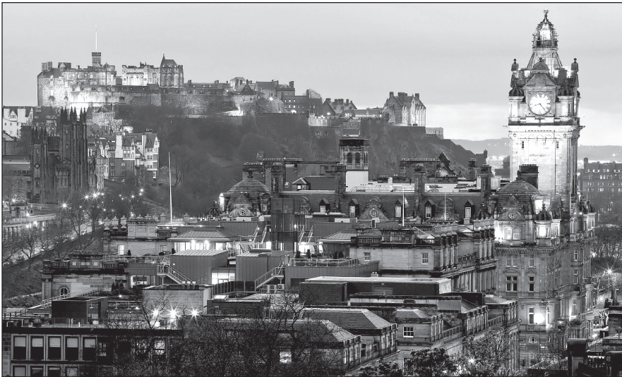
Edinburgh at night with a view of Edinburgh Castle

The 22nd Academy of Marketing Science World Marketing Congress took place between 9th and 12th July, 2019 in Edinburgh, Scotland, welcoming more than 300 delegates from over 60 different countries. The conference was hosted by University of Edinburgh Business School and held at the University's John McIntyre Conference Centre. Whilst the weather was mostly on the cool side, even by usual Scottish summer temperatures, it didn't dampen the spirits as delegates still enjoyed the historic city of Edinburgh and all it has to offer.