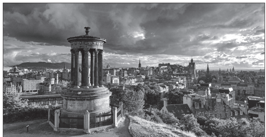
Edinburgh from Calton Hill

A very important part of the World Marketing Congress is the cultural programme that runs alongside the serious academic programme. Our social programme kicked off with a Welcome Reception at the John McIntyre Conference Centre on Tuesday evening, providing an opportunity for delegates to network over a glass of wine or two. On the Wednesday evening, we departed from the Conference Centre and gathered at the Playfair Library Hall, in the University's Old College, for a chance to sample some of Scotland's finest whisky and gin