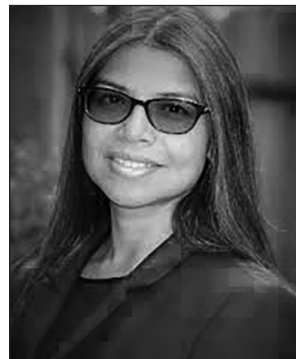
2020 AMS Conference Co-Chairs